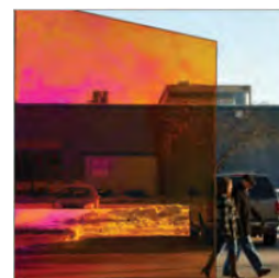
Chill Product: Blue/Magenta/Yellow in transmission at various angles