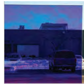
Blaze Product: Cyan/Blue/Magenta in transmission at various angles